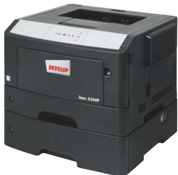
ineo 3300P with additional 550-sheet cassette (PF-P12)

If the operating system on your current printer is frustratingly difficult to follow and the device is difficult to use, it's time you considered switching to an ineo 3300P. Its ease of use will save your and your staff's time and effort in everyday printing jobs. And nobody will have to consult an operating manual before using this new printer.