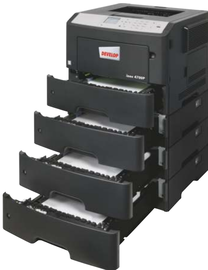
ineo 4700P with three additional paper cassettes (PF-P12)

If the operating system on your current printer is frustratingly difficult to follow and the device difficult to use, it's time you considered switching to an ineo 4700P. Its 2.4-inch colour display ensures intuitive operability and highlighted menus show users the system's status, operating options and settings. What's more, a folder-like navigation concept means the ineo 4700P is easier to use than many older systems. This saves your staff time and effort in everyday printing jobs. And nobody will have to consult an operating manual before using this new printer.