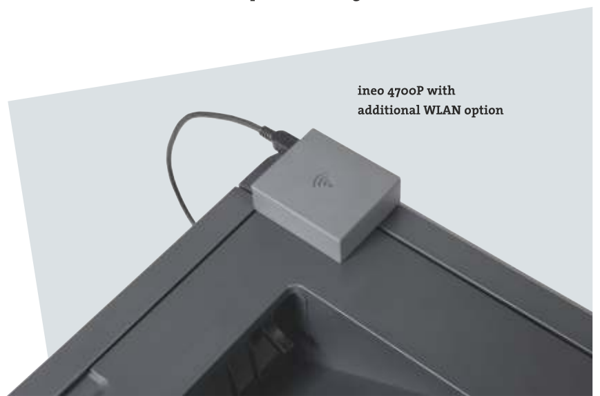
ineo 4700P with additional WLAN option

If there is not much room in your office or you need a desktop printer, the lightweight design and small footprint of the ineo 4700P are a big advantage. The fact that this high-performance office printer can easily be placed on a desktop and does not need a room of its own is extremely convenient for staff in an HR or finance department, for example, where confidential documents should not end up in the wrong hands.