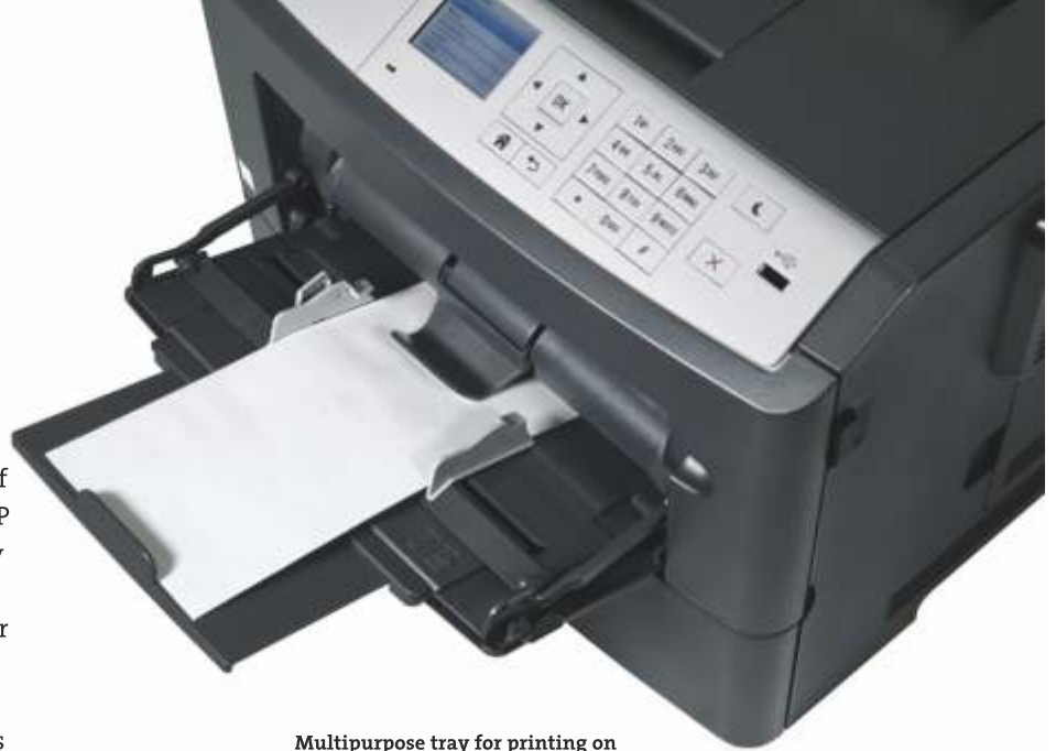
Multipurpose tray for printing on special media such as envelopes

Are high-volume print jobs commonplace in your business? With a maximum capacity of 2,300 sheets you can be sure that the ineo 4700P will not run out of paper. And if you frequently print on different kinds of paper, e.g. with or without your corporate logo, you can have your ineo 4700P equipped with up to three paper trays (with 250 or 550 sheets). If the trays are stocked with different kinds, sizes and weights of paper (A6–A4 and 60–163 g/m 2 ), you ensure your staff to waste no time switching from one kind of paper to another, or running back to a printer that has run out of paper.