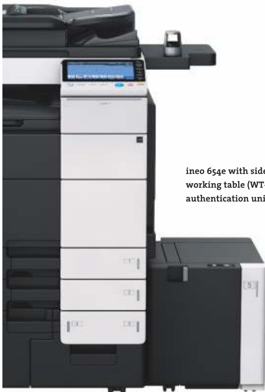
ineo 654e with side paper deck (LU-301), working table (WT-506) and finger vein authentication unit (AU-102)

The ineo 654e prints and copies at 65 A4 pages per minute (ppm). That means your staff can leave this machine to get on with any high-volume job while they carry on with their daily office work. In the multi-user environment of a departmental device or centralised office location and at an in-house printshop, this will also eliminate job queues, or at least shorten waiting times. Since this machine prints or copies in duplex mode at full speed, it will also save you money by reducing your paper consumption on high-volume jobs.