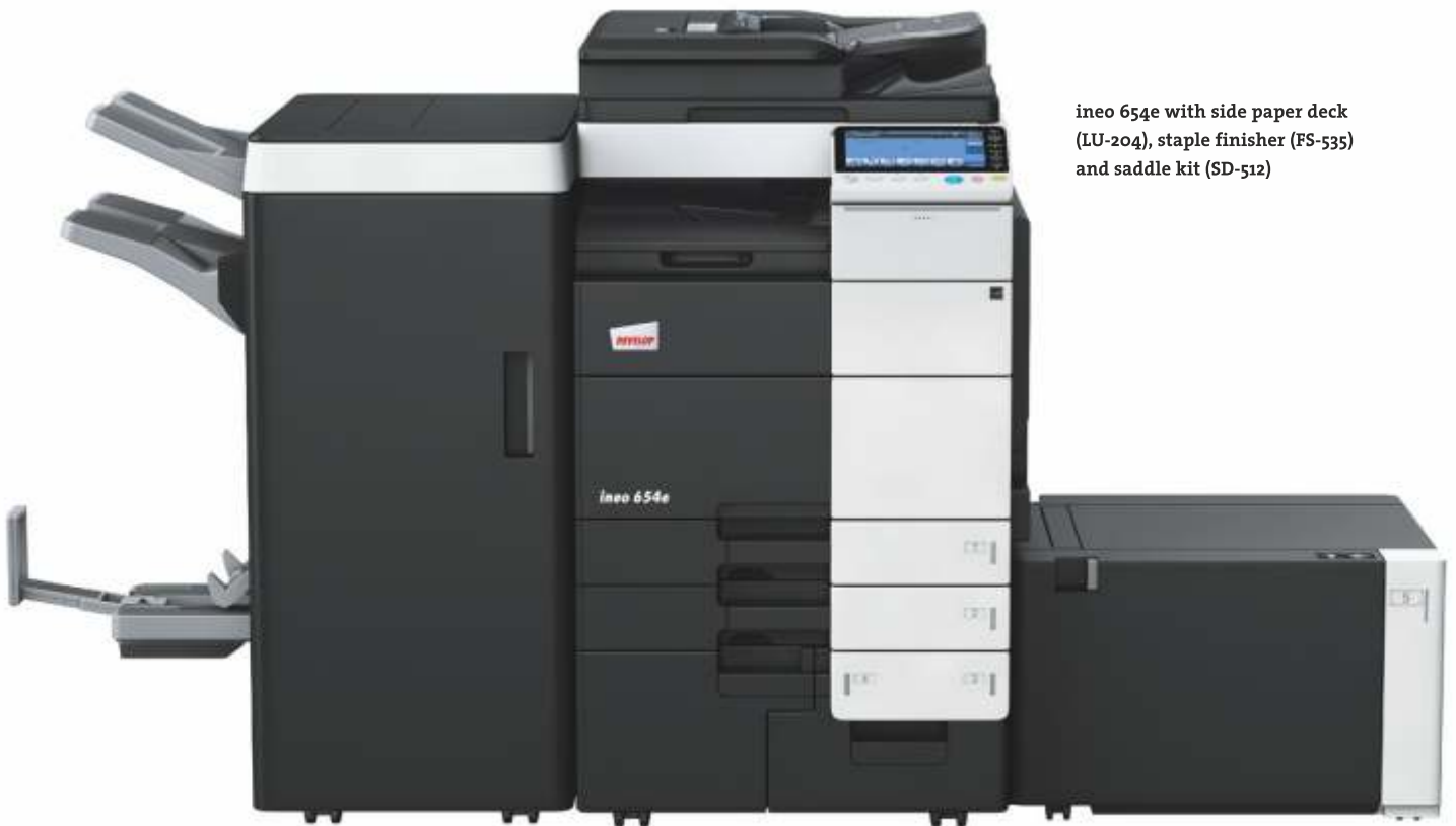
ineo 654e with side paper deck (LU-204), staple finisher (FS-535) and saddle kit (SD-512)

Viruses, Trojan horses, hacker attacks: these days, no business can afford to ignore the challenging issue of IT security. That's why the ineo 654e is certified to ISO 15408 EAL 3, the industry's security standard for multifunctional systems. What's more, it also comes equipped with numerous data-security features such as IPsec encryption, which ensures secure communication channels for all documents passing through your company's network. There is no danger of confidential documents or data getting into the wrong hands either since access to the system can be restricted to authorised users by means of the standard hard-disk encryption kit and authentication technology. This way, we ensure your sensitive data stay secure – now and in future.