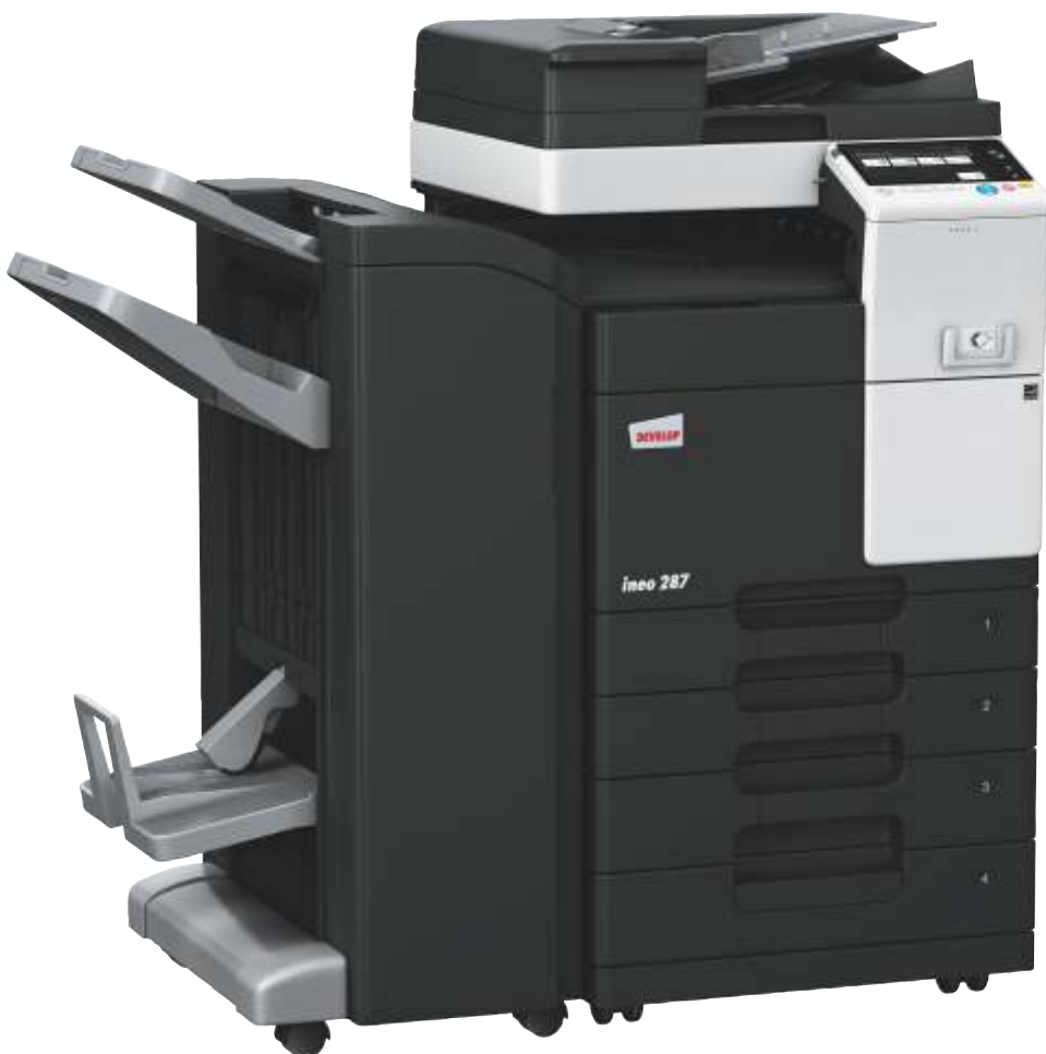
ineo 287 with document feeder (DF-628), staple/booklet finisher (FS-534SD), paper feeder (PC-213) and mount kit for local ID card authentication device (MK-735)

The monochrome devices features a variety of energy-saving functions that cut power consumption. Besides saving you money, these green features are also good for the environment – and your carbon footprint.