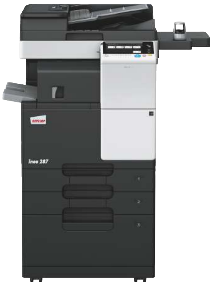
ineo 287 with document feeder (DF-628), inner finisher (FS-533), paper feeder (PC-413) and biometric authentication kit (AU-102)

Job centres, schools and universities, engineering firms, architect's offices, insurance companies, banks, libraries: many small to mid-sized businesses or organisations don't really need colour printing capabilities. What their users really require is a monochrome multifunctional device that is intuitively easy to use and offers simple mobile usability for the increasing number of mobile office workers.